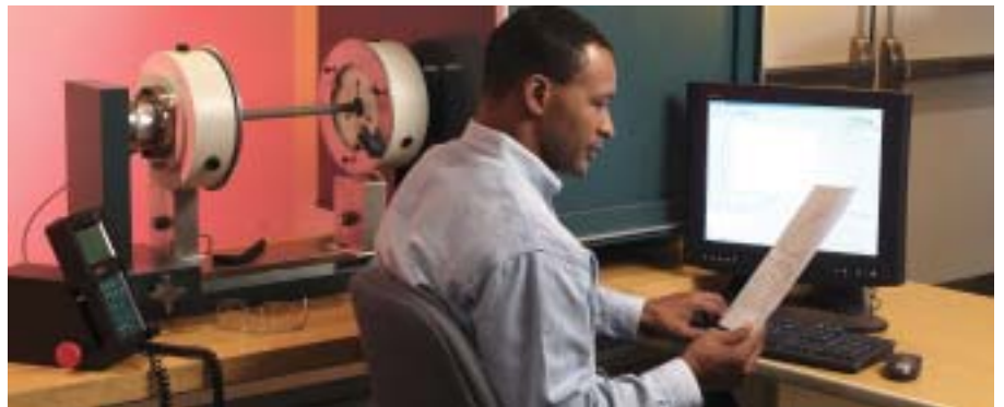
Fig 2. Bench mounted 10,000 in.lbf machine.

No system would be complete without controlling software and data analysis of the resultant data. The addition of a torsion test module to our Test Navigator software allows complete machine control along with capture and analysis of the resultant torsional test data, showing the material behaviour throughout the test.