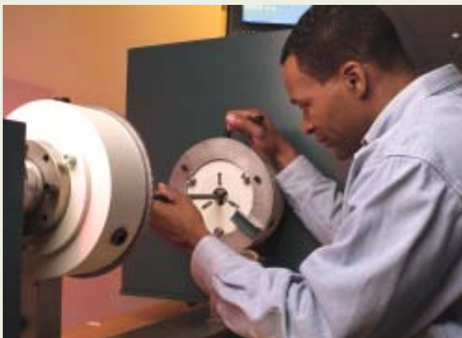
Fig 6. Samples are easily mounted in the patented bi-directional grips.