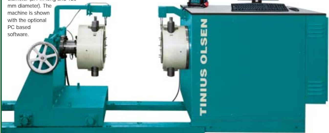
Fig 1. 200,000 in.lbf torsion tester for testing samples that are up to 7 ft long and 5 in diameter (2.1 m long and 125 mm diameter). The machine is shown with the optional PC based software.