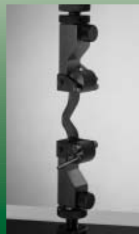
Grip Reference HT35

Description: Self tightening miniature knurled roller grips. Versatile and quick loading, suitable for flat dumbbell shaped specimens. The pivot position of the eccentric roller is set to give maximum gripping efficiency.