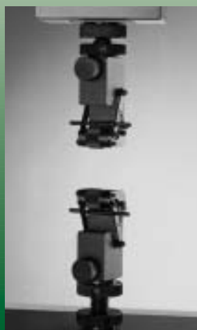
Grip Reference HT53