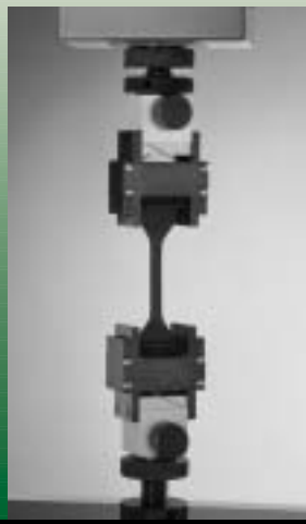
Grip Reference HT38