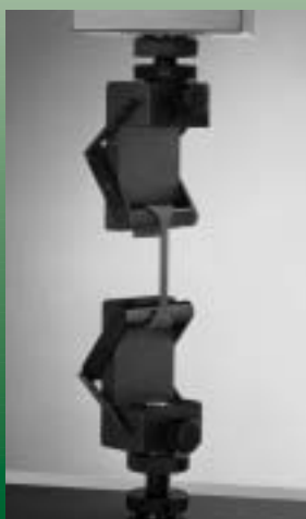
Grip Reference HT37