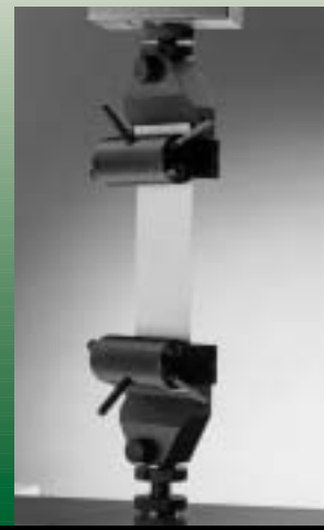
Grip Reference HT52

Description: Self tightening knurled roller grips. Versatile and quick loading, suitable for flat dumbbell shaped specimens. The eccentric knurled roller and serrated back plate provide efficient gripping on the smoothest specimen surface.